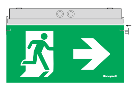
Step 5: Secure the marking panel to the second holding accessory. Place the second plastic cover and push till a click sound is heard.