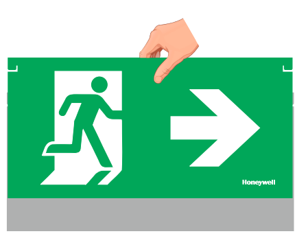
Step 1: Install the required pictograms to both sides.