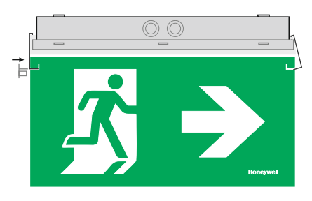
Step 3: Place the marking panel from the one Step 4: Place the plastic cover and push till a click sound is heard.