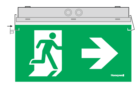
Step 3: Place the marking panel from the one Step 4: Place the plastic cover and push till a click sound is heard.