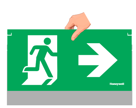
Step 1: Install the required pictograms to both sides.