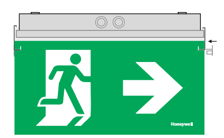
Step 5: Secure the marking panel to the second holding accessory. Place the second plastic cover and push till a click sound is heard.